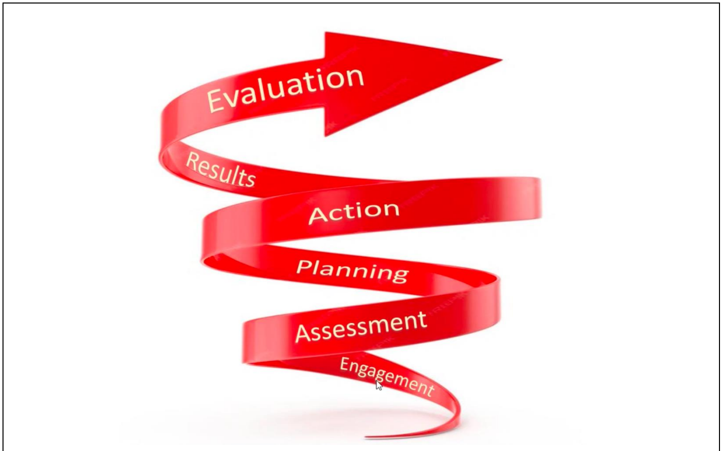
Figure 1: The helix model of CGC - Roundabout for Digital Transformation

We assume that phases 1-4 are the focus of counselling activities. The further phases 5-6 are closely linked to the implementation of further training and other activities and therefore go beyond counselling. The counsellor has a more accompanying and supporting role in these phases. From the perspective of the CET providers, the implementation of training measures is particularly relevant, but the design of the measures and the guidance of the participants in the learning process is not part of the guidance model developed here. From the employers' perspective, knowledge transfer - i.e., the use of learning outcomes in the work context - is the central perspective of assessment or evaluation. In this sense, their feedback to the guidance as well as to the CET is relevant, but again goes beyond the process of guidance and its evaluation.